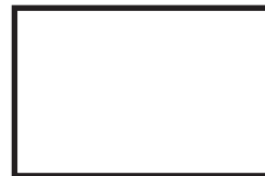
Half Pages 4.5" X 7.5"

ALL ADS SHOULD BE IN PDF OR JPEG FORMAT. NO BLEED